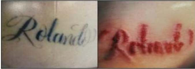
Case #6: (left) body art after 7 laser treatments. (right) immediately after liquid removal

Case #6 involves body art removal. Unbelievably, the before photo is AFTER seven laser removal sessions. There was also a hard rope-like bit of scar tissue built up under each letter. After the first liquid removal