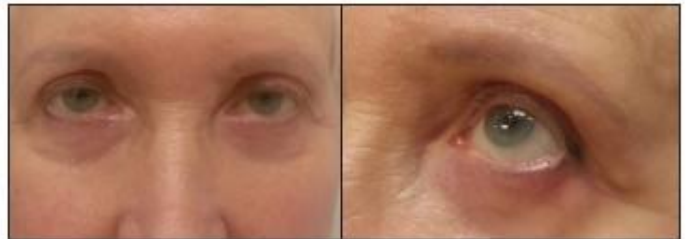
Case #2: healed after removal (front and side)

and depth of color. She requested better color and shape, and one that included hair strokes.