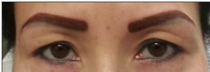
Case #3: Drawn on NEW DESIGN revealing areas under arches still needing a 3rd session

was firm with tight circular motions. The removal product was applied once the skin was properly prepared and removed according to manufacturer guidelines, and then followed with cleanup and post procedure care and healing protocol.