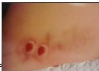
Case #6: body art after last removal session.

to see the final healed result because she moved out of state. However, she has since told me it is barely noticeable at all. Her ethnic heritage is Hispanic, but there was never any hyperpigmentation from the liquid removal process. She did have a slight ring of hyperpigmentation around the area from the laser when