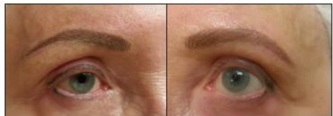
Case #2: healed after removal and hair stroke Correction.

To ensure a better canvas for redesign and color, the proposal was an overall removal of her existing pigment. The removal product was used along with a #14 round tattoo needle in a rotary machine.