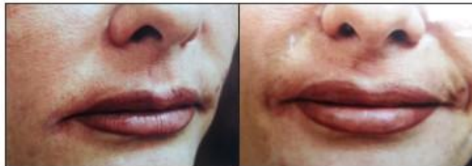
Case #4: (left) shows removal area plus color and line correction (right) crisp lip line and color blend

vermillion, the tissue texture and thickness are much different than the lip tissue or the vermillion border. That is one reason for choosing a #8 round needle instead of the usual #14 round. Healing for this kind of removal is TOUGH on the client, as this is an area that stretches and is difficult to keep absolutely dry. My goal was to accomplish the removal in ONE