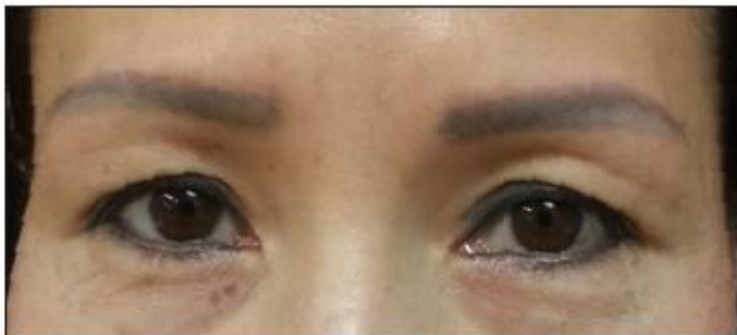
Case #3: "Healed result of first removal session"

The next case was a client who presented with a list of problems: 1) the brow shape was totally wrong; 2) a cover-up was attempted with camouflage pigment; 3) the situation was made even worse when another bad shape was put on top of the camouflage. This was a