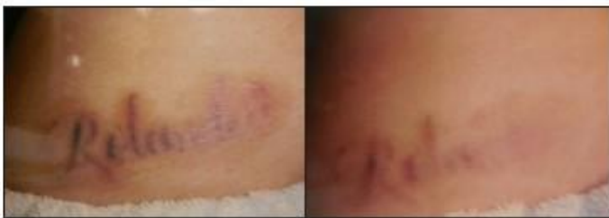
Case #6: (left) healed after removal and before another. (right) healed after more removal.

This client had eight sessions with me. I did not get