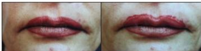
Case #4: (left) before removal of recent color refresh by another tech outside vermillion. (right) immediately after removal

Client #4 had an upper lip line that was WAY too high for her liking. In this case, a #8 round needle and rotary machine were used. The commercial removal product was used to remove some of the width that extended beyond the vermillion border. One removal session took away the undesired part of the original