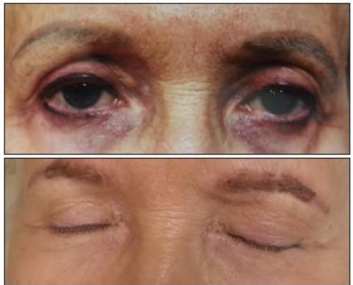
Case #2: (Top) initial presentation, two colors & uneven; (bottom) after removal, scabs during healing process.

gray and brown) in her brows and an uneven shape