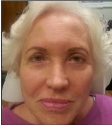
Case #2: hair stroke Correction after healed removal.

The appearance just depends on what she does with her facial expression.