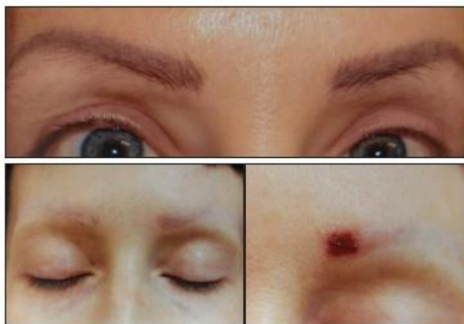
Case #5: (top) before and requesting complete removal (bottom-left) healed after second removal (bottom-right) removal of small area in head of brow only.

This was a client who wanted her pigmented brows COMPLETELY GONE. I performed three removal sessions, and the third was to treat a tiny bit of grey still left in the front left brow. All of the removal sessions were done with a #14 round needle. The client is out of the country right now, but reported that the